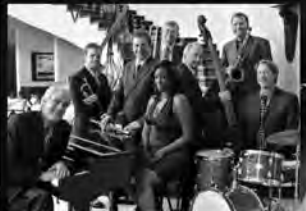
Side Street Strutters Tuesday, September 20, 2022 "...performed with fire and precision." - Larry Elgart, "The Ambassador of Swing"