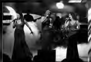
Divas 3 Thursday, February 23, 2023 "...the crowd went wild!" - Wildstein Center for the Performing Arts