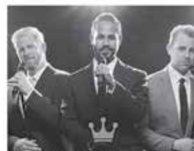
Bachelors of Broadway Thursday, September 12, 2024

"This show features new life size vintage costumes from the Golden Age of Broadway including: Alfred, Phantom of the Opera, Showgirls, and more!"