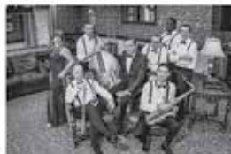
Good Shot Judy presents "The Century of Swing" Thursday, April 3, 2025

"These three sisters have been performing for over 20 years. They have won many awards and are a true talent!"