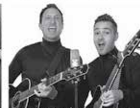
Forever Simon & Garfunkel Thursday, November 7, 2024

"This show features new life size vintage costumes from the Golden Age of Broadway including: Alfred, Phantom of the Opera, Showgirls, and more!"